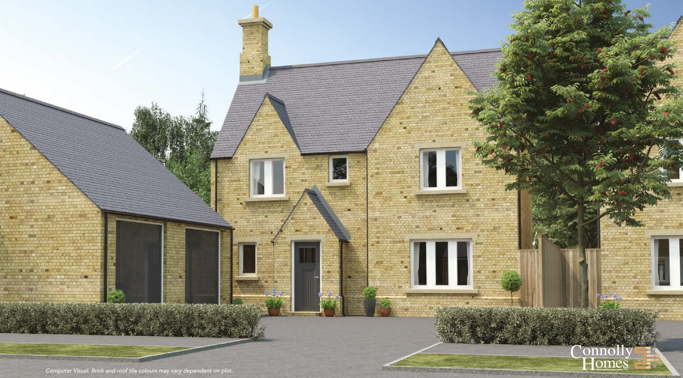
Computer Visual. Brick and roof tile colours may vary dependent on plot.